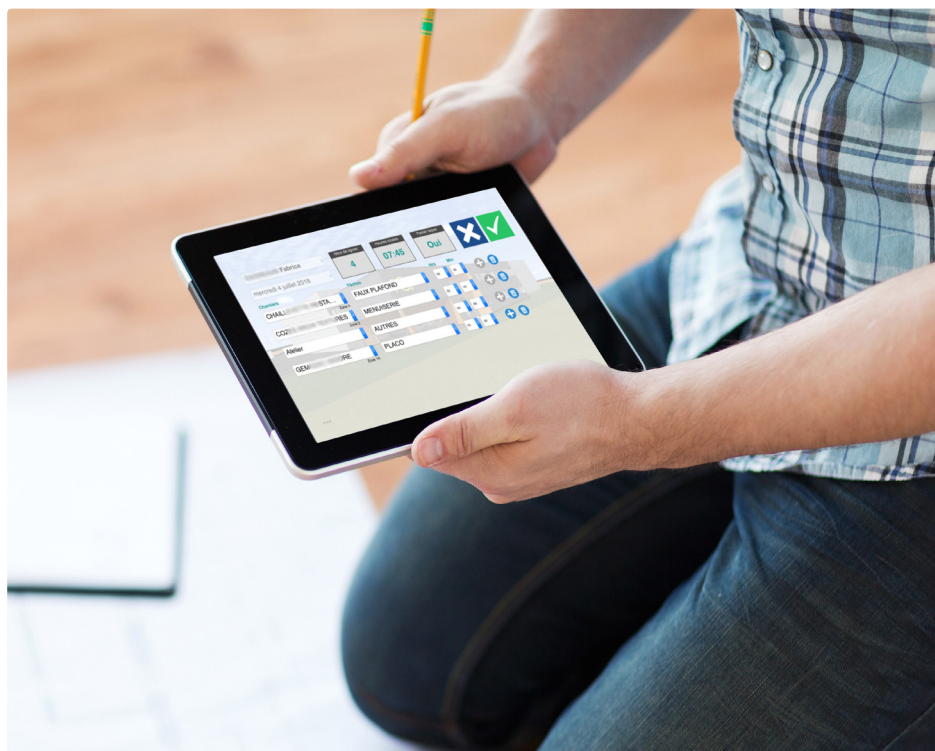
Time management app for tablets developed in 4D by BSPOKE

Internet and Mobile Media Vocational Degree (I2M) student at Saint-Dié-des-Vosges IUT, final-year internship with BSPOKE